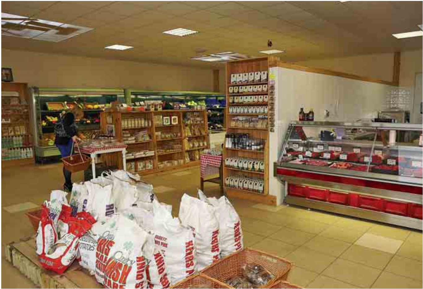
Hillsborough Farm Shop