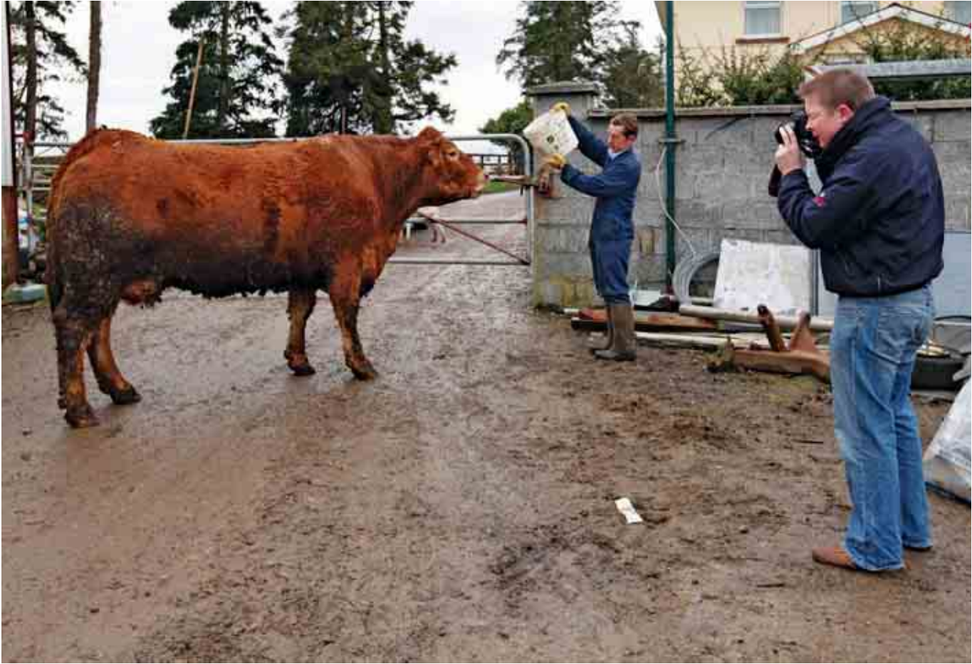
Taking a photo of a pedigree animal for the website.