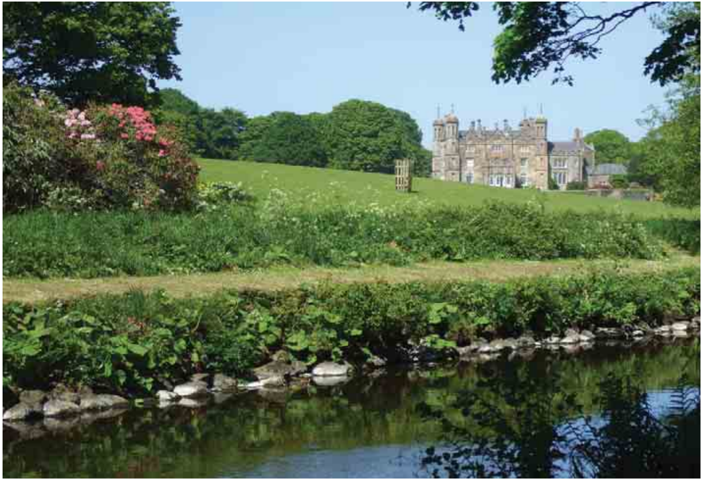
Glenarm Castle grounds, where the Highland Games NI have been held, has a walled garden.