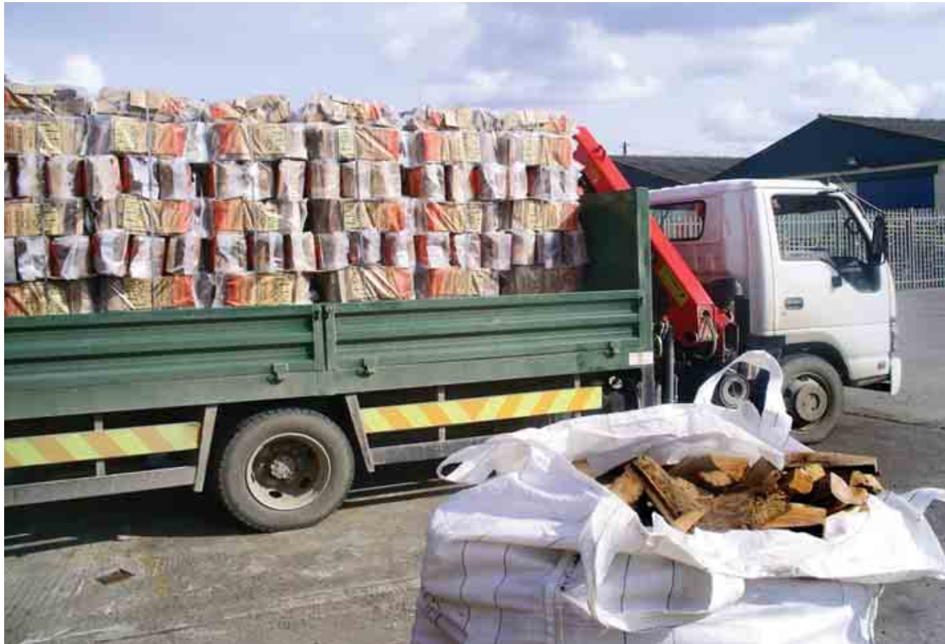
Full truckload at Forest Fuels Ltd.