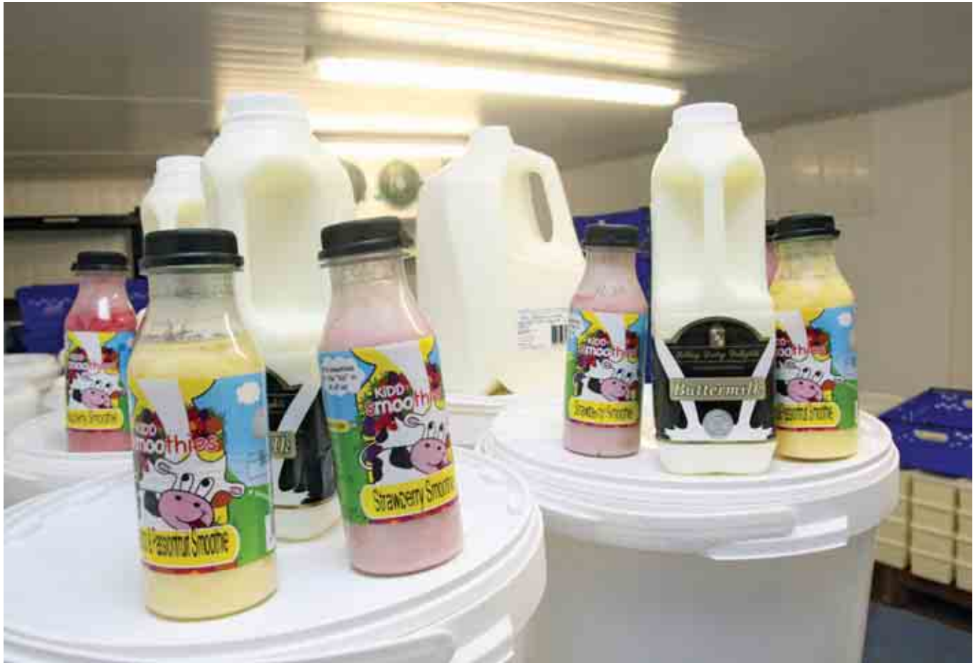
Some of the Kilbeg Dairy delights.