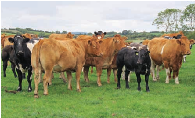
Cows are predominantly Limousin breeding and served with Limousin and Blue sires.

months. In 2013, heifers had a calving interval of 377 days between their first and second calving.