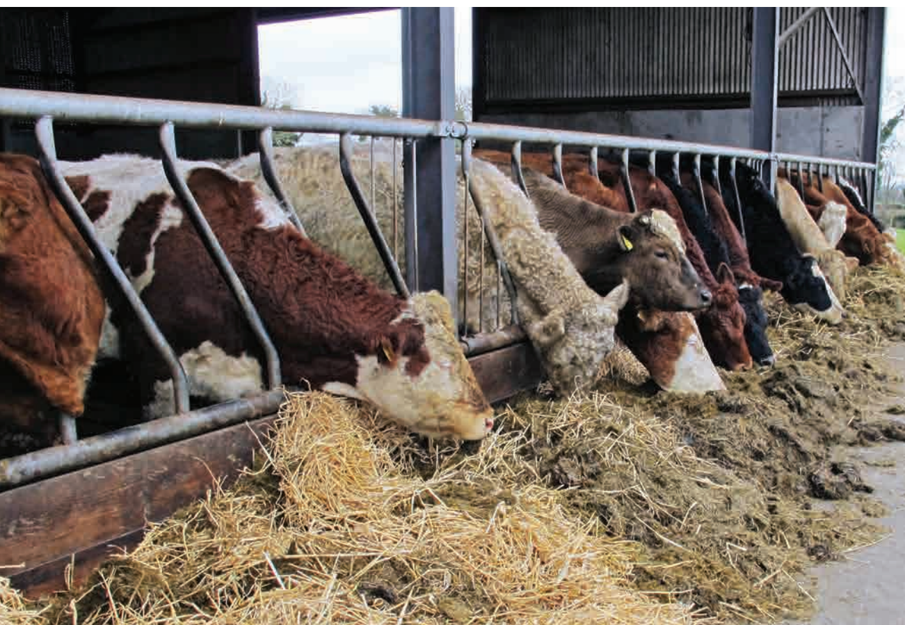
Silage is variable on the BETTER Farms and cows are being fed based on body condition and fodder quality.

BUSINESS, ENVIRONMENT, TECHNOLOGY through TRAINING EXTENSION RESEARCH