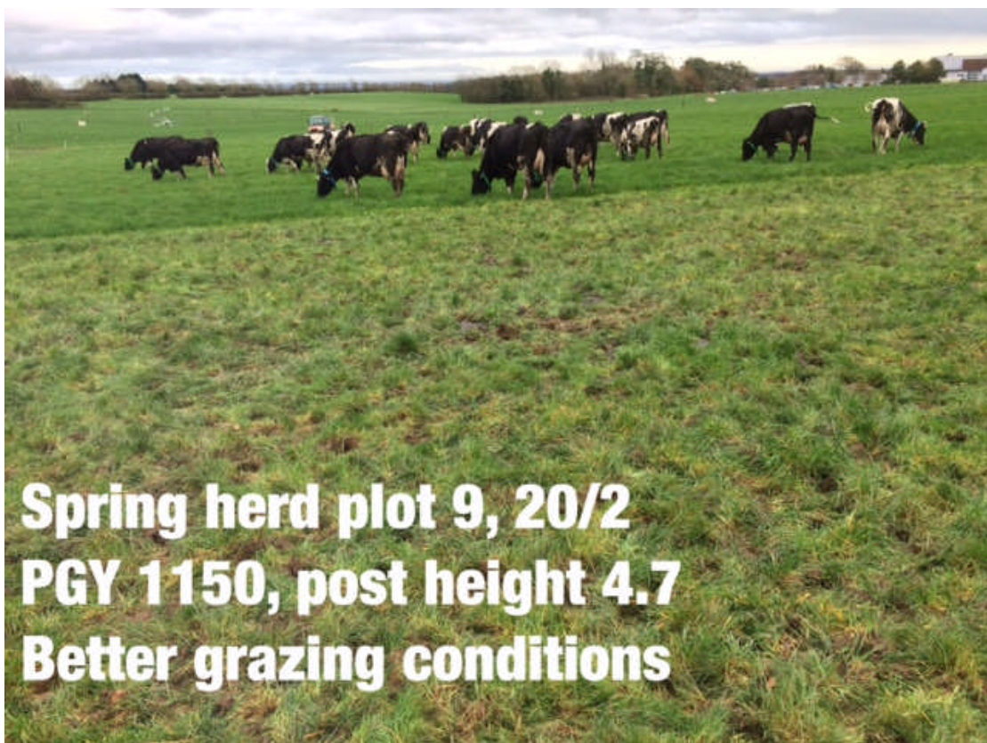
Spring herd plot 9, 20/2 PGY 1150, post height 4.7 Better grazing conditions