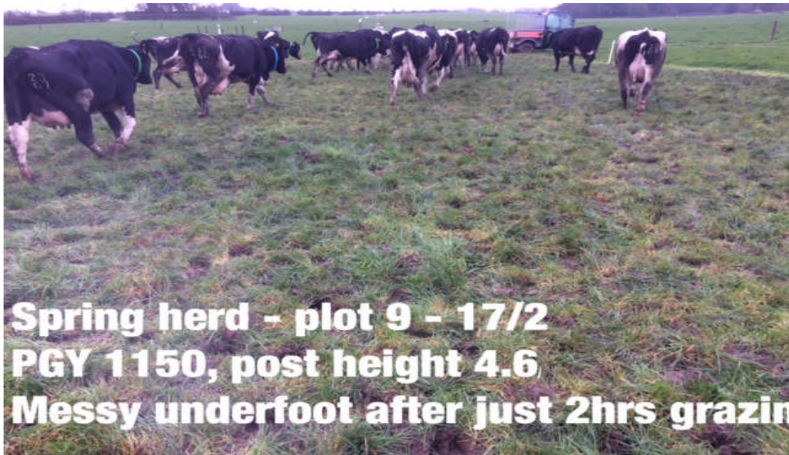
Spring herd - plot 9 - 17/2 PGY 1150, post height 4.6 Messy underfoot after just 2hrs grazing