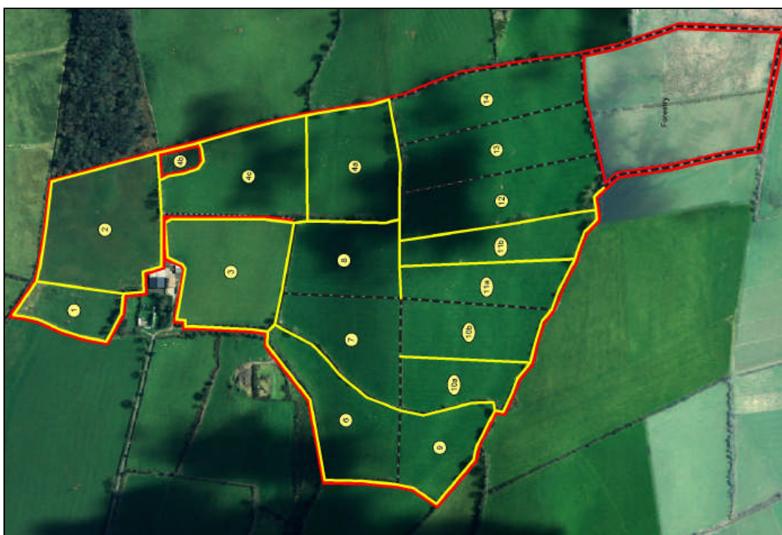
Figure 2. Field divisions on Rosnacartan farm

— Farm has yielded over 5000kg/Dm/ha this year to date