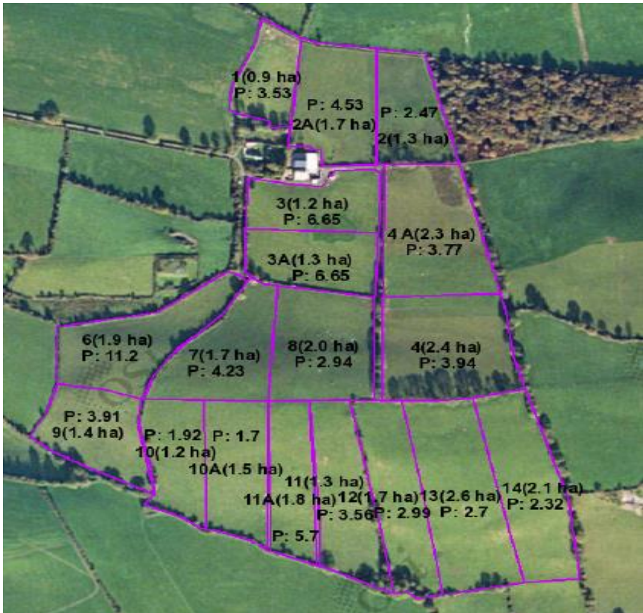
Figure 2. Field divisions on Rosnacartan farm.