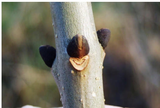
Fig. 1 Hybrid / F. angustifolia Note three buds on the same plane,