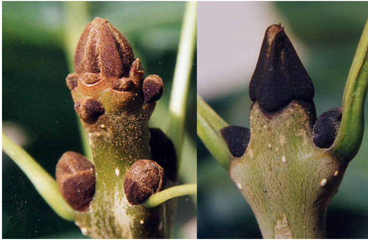
Fig. 2 Brown bud' ash (left) above has more rounded buds than common ash F. excelsior (right)