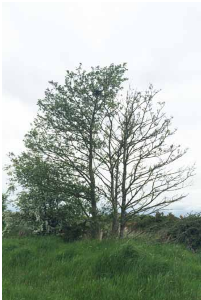
Figure 7 Dieback of Alder caused by Phytophthora alni

Other Phytophthora species detected in Irish forests by the PHYTOFOR researchers include Phytophthora pseudosyringae , Phytophthora cinnamomi , Phytophthora alni (Fig. 7), Phytophthora gonapodyides and Phytophthora chlamydospora . The first three species listed are plant pathogens, with P. pseudosyringae emerging as a worrying threat to Irish forests following its detection in Japanese larch, European beech and Southern beech in Ireland. The final two species listed are usually found in streams and rivers, where they function as decomposers of decaying plant litter and sometimes as opportunistic pathogens. One significant trend world-wide, which has also been noted in the PHYTOFOR research, is the increasing number of invasive alien Phytophthora species being detected in natural habitats. Many of these pathogens are being brought in to the country on infected plants, and could represent a serious threat to Irish ecosystems in the near future.