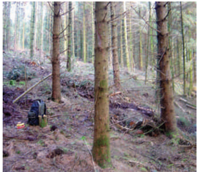
Thinned stand, age 42 years, no mortality

Figure 2: Forests that remain unthinned have a high degree of mortality, thinning salvages timber before it dies.