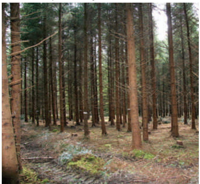
Photo: First thinning in Sitka spruce showing removal of line and selection of inferior trees between lines leaving the larger trees to produce more valuable timber.