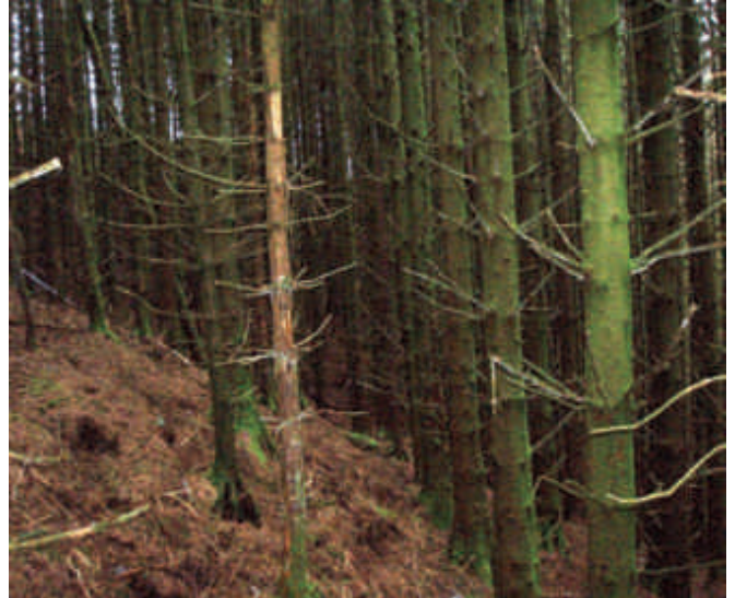
Unthinned stand, age 42 years, high mortality

If forests are left unthinned, there is a high incidence of mortality in the forest i.e. trees will progressively die, leading to a reduction in total timber volume production. If these trees are removed by thinning operations, a proportion of the timber volume can be salvaged resulting in an increase in volume production over similar unthinned stands (figure 2).