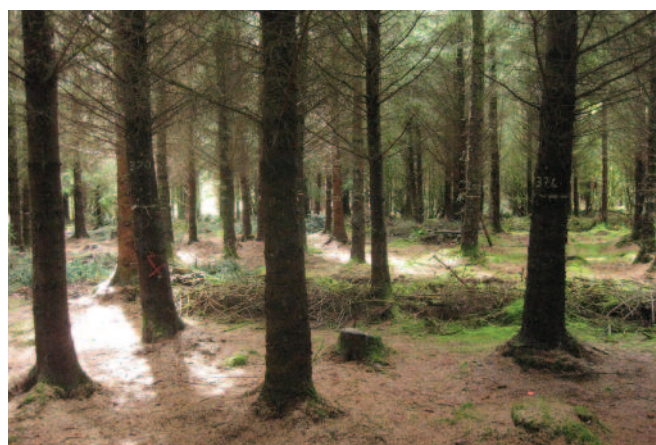
FIGURE 1: Increased growing space following thinning facilitates increased growth.

increased with thinning intensity, with yield increasing from 29% of total volume in the light thinning, to 59% in the medium thinning, and 65% in the heavy thinning treatment. Timber revenues for second thinning ranged from €334/ha for the light thinning, to €691/ha for the medium thinning and €748/ha for the heavy thinning. Total revenue generated from the two thinning operations was greatest in the heavy thinning at €1,364/ha, with €1,255/ha for medium and €809/ha for the light thinning. No revenue was generated for the unthinned control plots (Table 1). There is no indication that heavy thinning is negatively impacting on volume production of the crop, with only a modest decrease (1% difference) between the control and the heavy thinning. Thinning has facilitated the development of larger trees as a result of increased growing space, with the average trees in the heavy thinning nearly twice the volume (0.4m 3 ) of the trees in the control treatment (0.23m 3 ) (Figure 1). Thinning has greatly enhanced the quality of the remaining trees, with the greatest amount of straight logs apparent in the heavy thinning treatment (Figure 2).