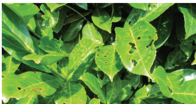
FIGURE 2: Shot hole symptoms on a P. laurocerasus Rotundifolia hedge associated with Micrococcus aloeverae .