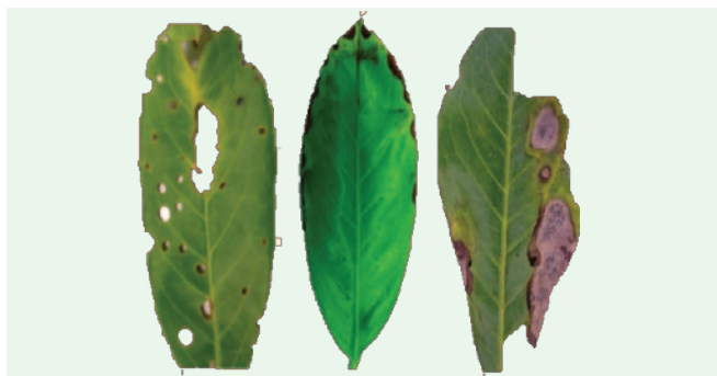
FIGURE 1: Disease symptoms on cherry laurel cultivars. Pss on Etna (left and middle); Neofabraea sp. on Etna (right).