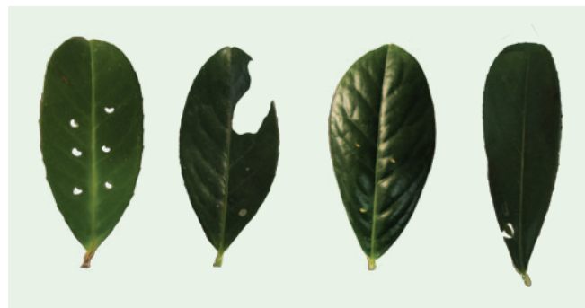
FIGURE 3: Pss symptoms on (from left): Rotundifolia, Novita, Etna and Causcasica.