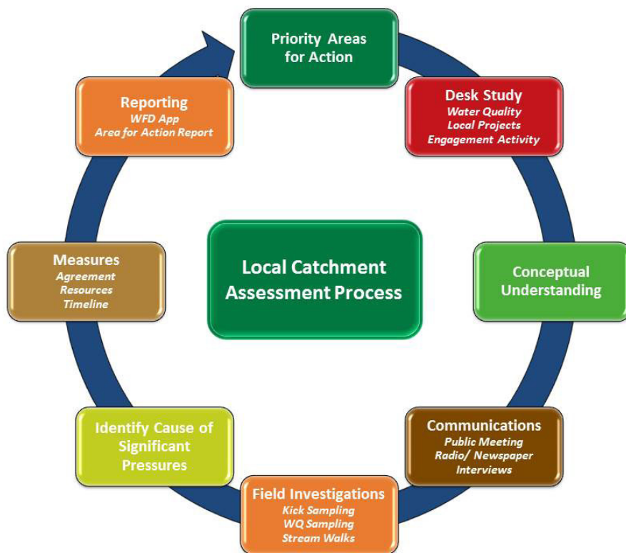
Figure 3: Graphic showing the Local Catchment Assessment Process

Any new information received through the consultation processes is included in the desk study. The next step on the process is to plan and prepare for PAA visits incorporating fieldwork. Fieldwork involves systematically working through the catchment, recording presence and abundance of macroinvertebrates and macroalgae. Field parameters are also measured, where required water samples are taken for chemical analysis, and the physical condition of the river is assessed. All these can help improve the understanding of what is happening in a river catchment and if it is affected by pollution. This will help identify what the water quality pressures are in a PAA. The typical pressures found in PAA's are diffuse phosphorus (P), nitrogen (N) and sediment losses, point sources, toxicity and pesticides and ammonium.