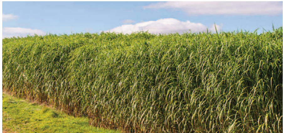
Optimal planting density is 16,000 plants/ha.

Rhizome pieces must have plenty of buds, and be kept moist and at low temperatures before replanting. The