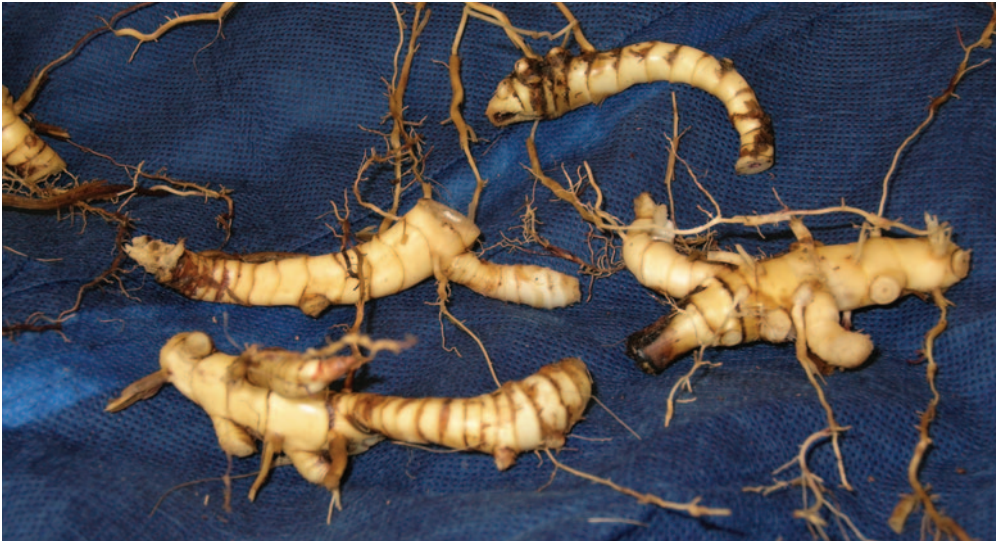
The majority of miscanthus crops are of the triploid type M. giganteus , which is sterile and has to be propagated vegetatively by mechanical separation of the rhizome into small sections for replanting.

equipment such as potato planters or bespoke planters. A planting depth of 5-10cm is recommended. Establishment costs are high.