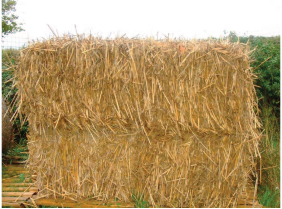
From November miscanthus starts to lose its leaves and goes into senescence.

The lower the moisture content, the higher the energy yield and bale value. The crop should be baled into large square bales 8 x 4 x 2 to facilitate transport. The bales must be stored under cover.