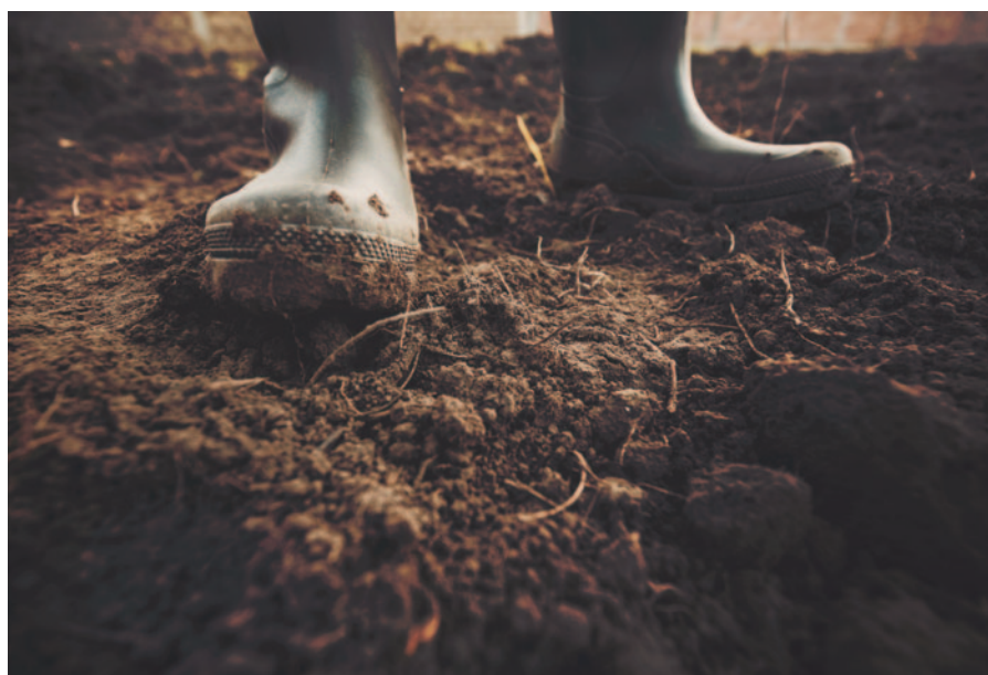
A soil pH of between 5.5 and 7.5 is ideal for miscanthus.

However, as miscanthus is harvested in early spring, it is essential that the soil is trafficable at that time.