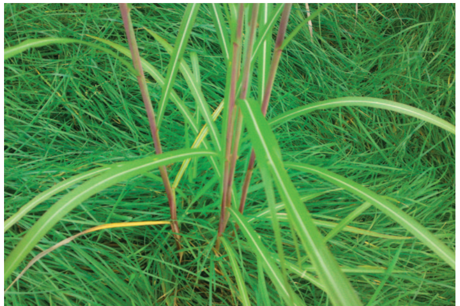
After the first two to three years, herbicides are generally not required.

Glyphosate has been used at Oak Park to good effect between the harvest and beginning of spring growth. However, considerable care needs to be exercised when applying glyphosate to control grass weeds. Application timing is critical and glyphosate can only be used when the crop is in its dormant phase. Recent research has suggested that topping in mid January to mid February, followed by glyphosate application within three weeks, can control grass weeds without having an adverse effect on miscanthus. Spraying of glyphosate should be completed by mid March. The precise timing of glyphosate application may vary