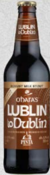
Lublin to Dublin Milk Stout – Collaboration Brew 50cl