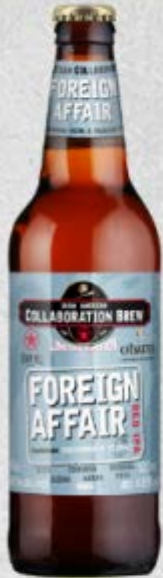
Foreign Affair – Collaboration Brew 50cl