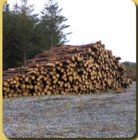
Improves efficiency of timber harvesting

The process to receive approval to construct a forest road may take some time.