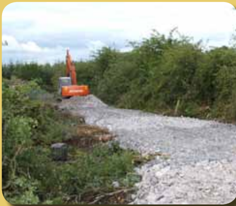
Build road in dry weather