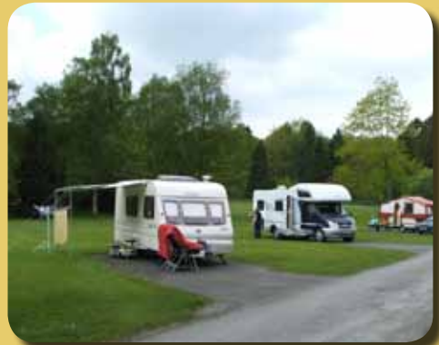
Provides recreation opportunities

Important component in an overall forest fire plan.