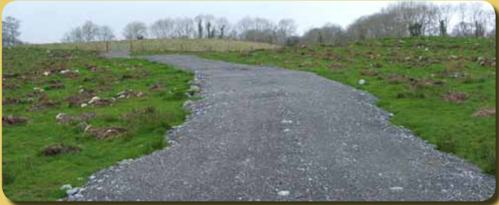
A management track provides access to young forests

There are two main types of forest road – management track and harvest road.