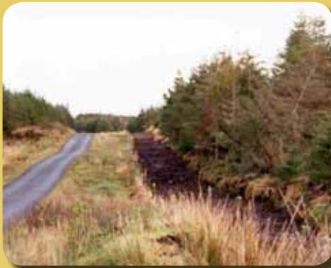
Important role in fire prevention

The process to receive approval to construct a forest road may take some time.