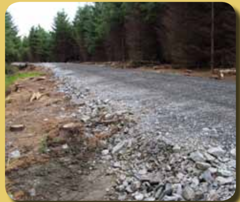
Completed harvest road

Construction works should be carried out by competent and experienced plant hire contractors with professional supervision.