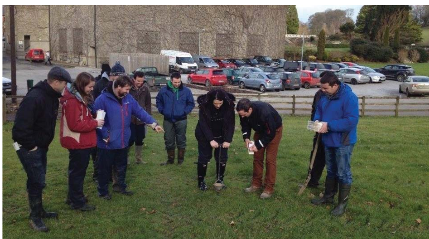
Distance education includes some classroom sessions and in-field practicals, as well as web-based learning. It is ideally suited to those who wish to earn a Green Cert while holding a full-time job.