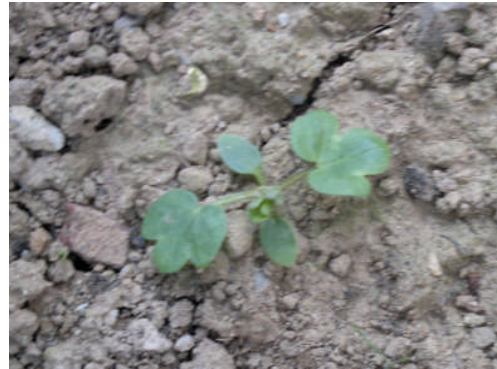
Photo taken 5 weeks after re-seeding