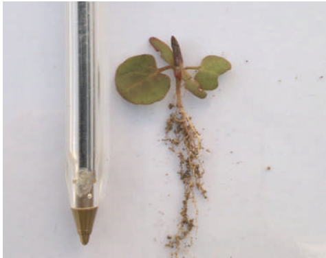
Photo taken 5 weeks after re-seeding