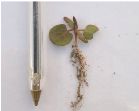
Photo taken 5 weeks after re-seeding