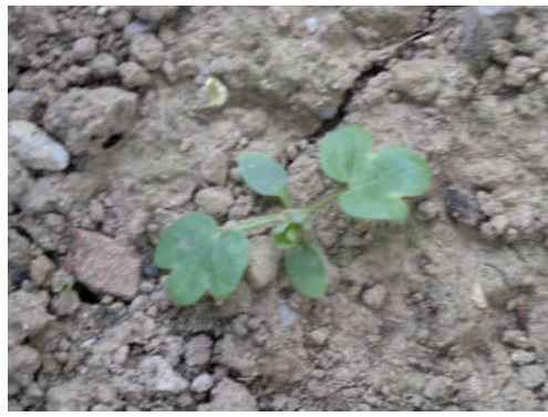
Photo taken 5 weeks after re-seeding