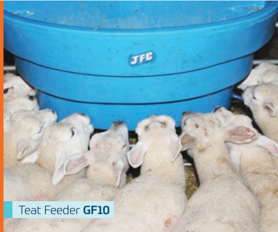
Teat Feeder GF10

see our wide range of sheep farming products