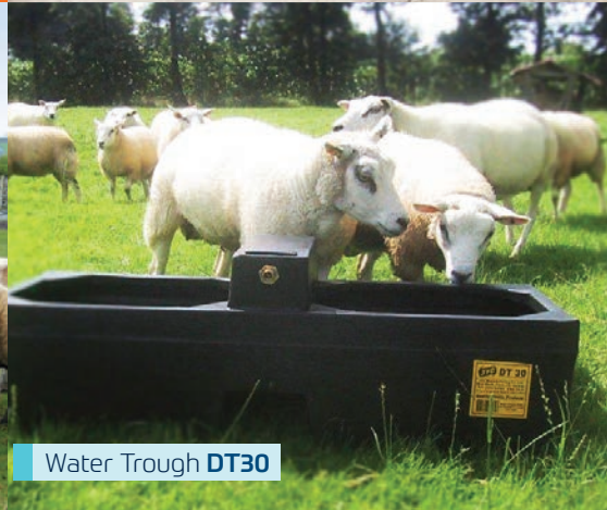
Water Trough DT30