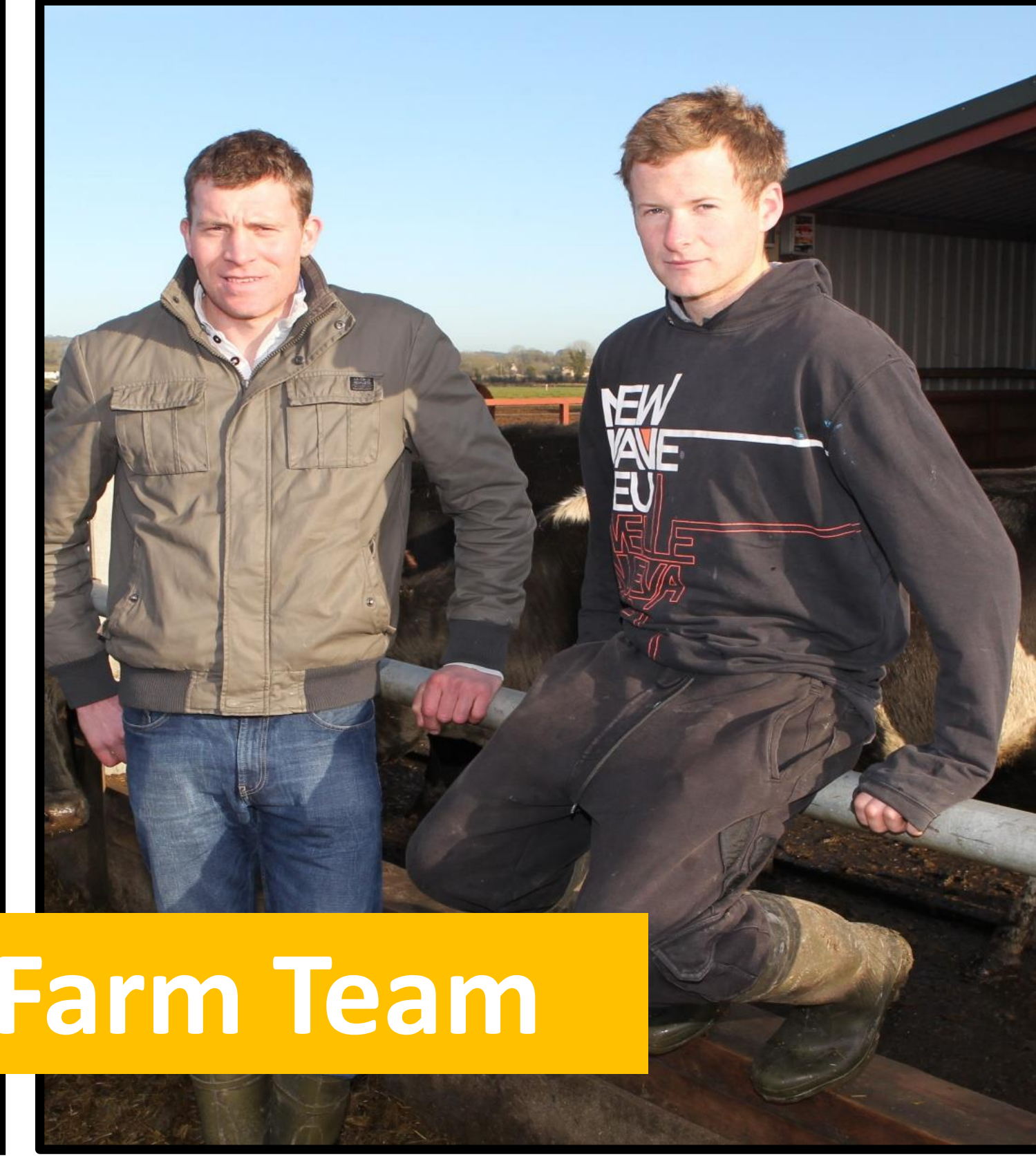
Fantastic Farm Team