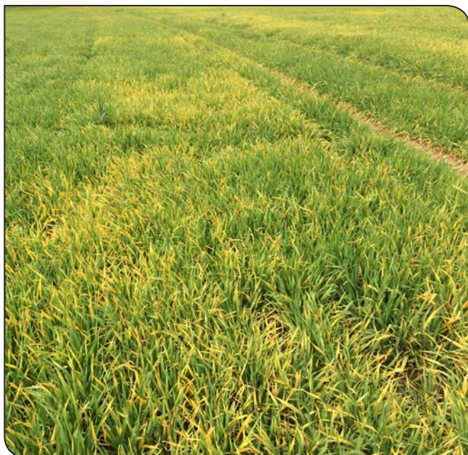
Delayed sowing will decrease the risk of BYDV