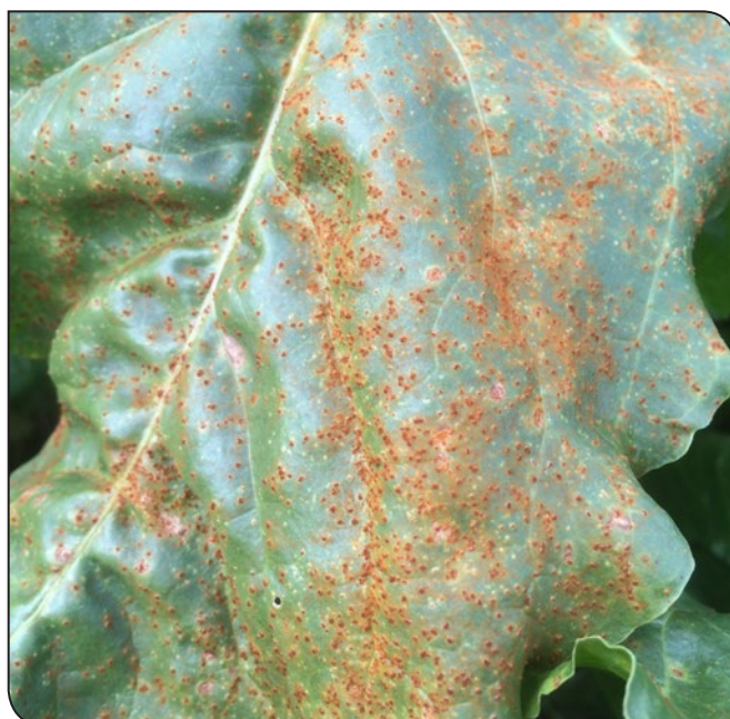
Rust is evident in fodder beet this year especially on crops did not receive a fungicide.