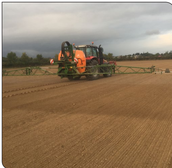
Best control of annual meadow grass comes from pre emergence herbicide application