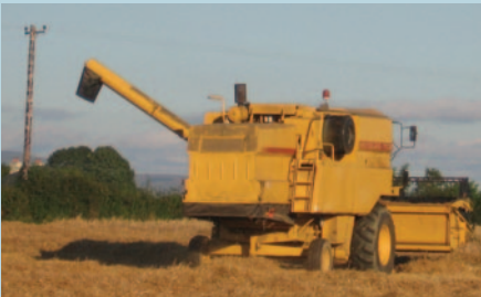
Harvest brings danger.

For the year to date, farm workplace deaths are above average (14 to mid July), so it is vital to give farm safety foremost attention to prevent further tragedy. August is harvest