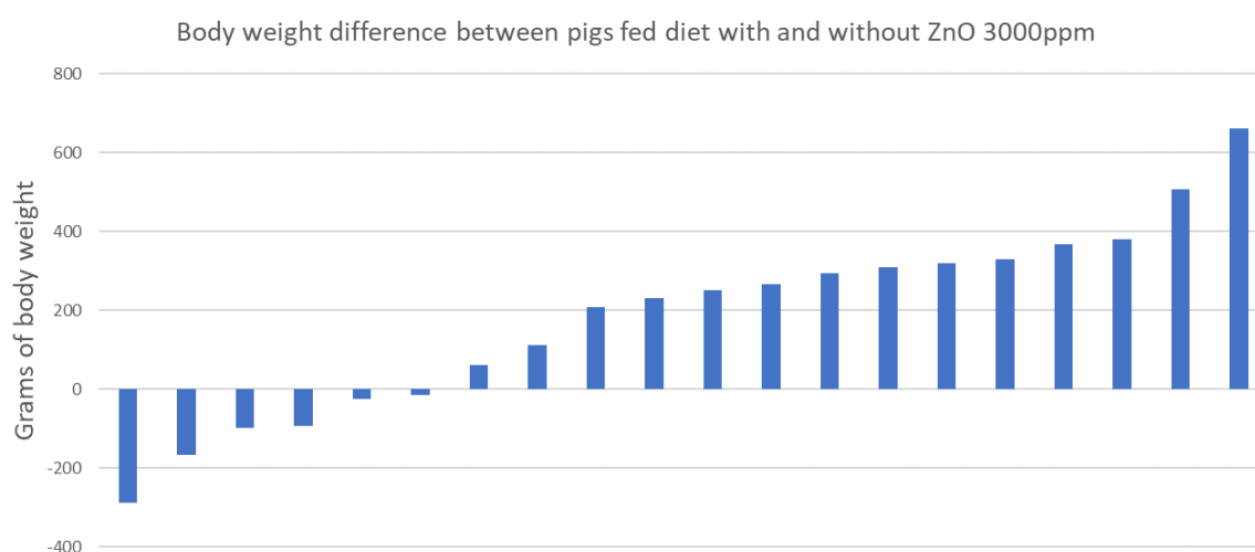
Figure 2. Difference on body weight between those pigs fed ZnO at 3000ppm and those fed with no ZnO two weeks post-weaning.

The situations that you want to avoid are when you end up with a group of pigs that show severe delays in growth or when you end up with high mortalities. In the figure 3, we can see a group of pigs that probably needed an intervention a bit earlier. The dirtiness of the pigs is quite a good indicator that something is starting to go wrong in this group of pigs. In this particular case, there was a problem with the ventilation of the room. This reminds us how important is to keep an eye on external factors despite the main change being the removal of the ZnO. Normally the outbreaks are triggered by these types of issues, e.g. drinkers not working, problems with ventilation, etc.