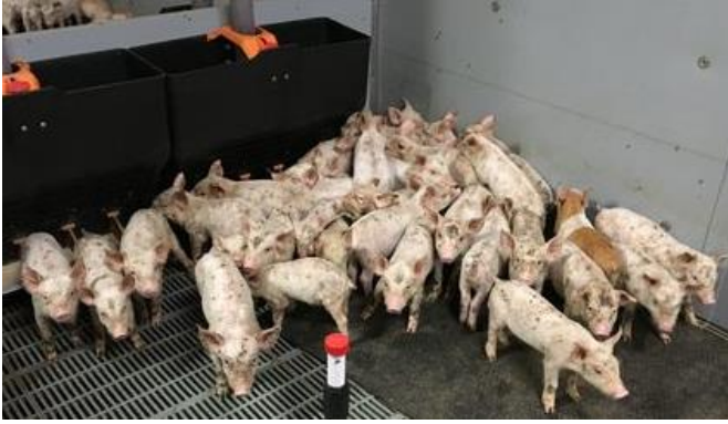
Figure 3. A group of pigs requiring intervention.

Finally, and probably the situation that you don't want to find yourself in, is having an outbreak in pigs that are fed without ZnO. Chances are that this will happen on your farm at some point. That is why it is important that you trial the removal of ZnO while you can still bring ZnO back. In case of a problem, you can re-introduce ZnO in the feed and try to learn from what the problem was. Once an outbreak happens, open the pigs or call the vet to do it, take samples before medicating the pigs and check for antibiotic sensitivity if possible, in those samples. You want to know if the antibiotic that you are using is working or if it is a waste of time. That will be your best weapon once ZnO is gone. Figure 4 was taken in one of the farms in the study. Pigs in good condition 4 days after weaning started to die very fast. The only external sign was sunken eyes in some of the pigs. There was a 3% mortality in one day. The stomach were full in all the pigs as you can see in the picture, intestines (and other organs) were hemorrhagic and empty. Samples were taken and the sick pigs were immediately put on to ZnO in feed and an antibiotic. Despite the improvement, the total mortality in 2 days was 6%. The bacteria isolated were sensitive to the antibiotic used so we know that for the next time this may be a good antibiotic to use.