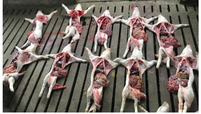
Figure 4. Post mortems were carried out on a study farm with high mortality.

Finally, and probably the situation that you don't want to find yourself in, is having an outbreak in pigs that are fed without ZnO. Chances are that this will happen on your farm at some point. That is why it is important that you trial the removal of ZnO while you can still bring ZnO back. In case of a problem, you can re-introduce ZnO in the feed and try to learn from what the problem was. Once an outbreak happens, open the pigs or call the vet to do it, take samples before medicating the pigs and check for antibiotic sensitivity if possible, in those samples. You want to know if the antibiotic that you are using is working or if it is a waste of time. That will be your best weapon once ZnO is gone. Figure 4 was taken in one of the farms in the study. Pigs in good condition 4 days after weaning started to die very fast. The only external sign was sunken eyes in some of the pigs. There was a 3% mortality in one day. The stomach were full in all the pigs as you can see in the picture, intestines (and other organs) were hemorrhagic and empty. Samples were taken and the sick pigs were immediately put on to ZnO in feed and an antibiotic. Despite the improvement, the total mortality in 2 days was 6%. The bacteria isolated were sensitive to the antibiotic used so we know that for the next time this may be a good antibiotic to use.