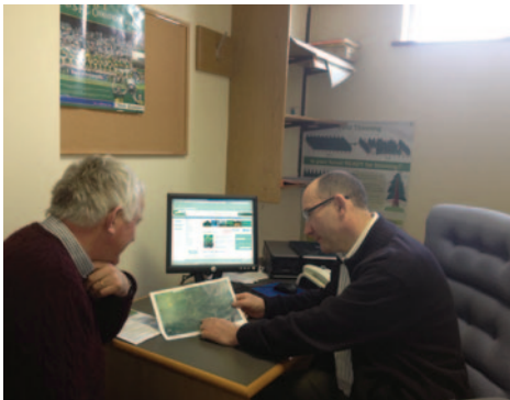
Teagasc provides extensive supports for people considering tree planting and new forest creation.

The current Forestry Programme remains open for applications and when details are finalised it is envisaged that applications in the system will be able to be transferred to the new Forestry Programme if applicants wish to do so.