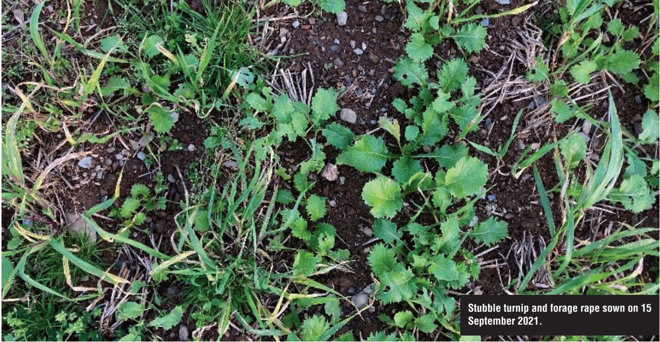
Stubble turnip and forage rape sown on 15 September 2021.