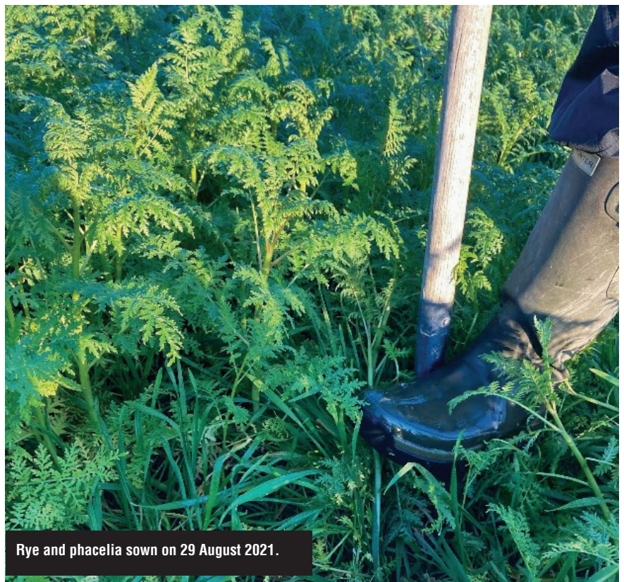
Rye and phacelia sown on 29 August 2021.

Figure 1 shows that for a cover crop sown in mid August, 54kg N/ha was recovered, while for the mid September, sowing date N uptake was reduced to 9kg N/ha.