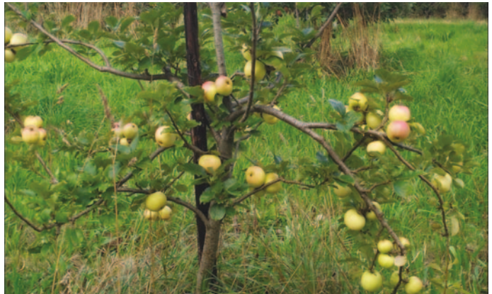
Traditional apple orchard.