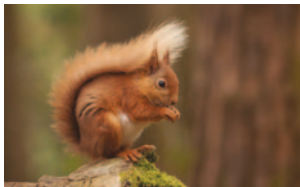
Red squirrel.