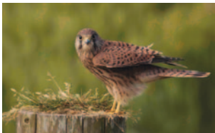
Kestrel.