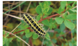
Six spot Burnet moth caterpillar.