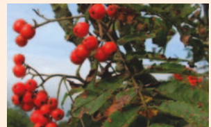
Mountain ash or rowan.