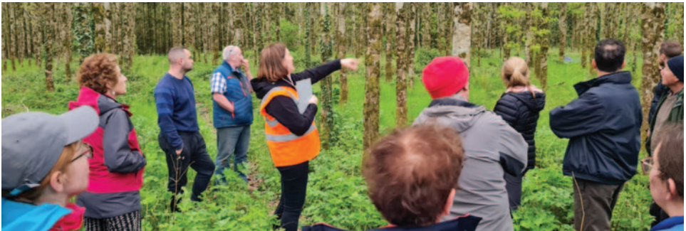
Forest events are a great opportunity to see tree planting in action, meet with forest owners and understand different forest types and management based on specific objectives.