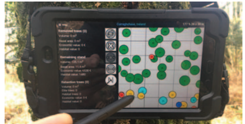
Marteloscope workshops encourage learning by doing.

and the other many important services that forests can provide to owners and society.