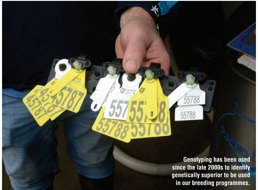
Genotyping has been used since the late 2000s to identify genetically superior to be used in our breeding programmes.

At the end of May, the Minister for Agriculture Charlie McConalogue announced funding to commence the process of genotyping the national herd. The scheme opened for applications on 21 June. The National Genotyping Programme partners include the Department of Agriculture, Food & the Marine, Dairy Industry Ireland (DII), Meat Industry Ireland (MII) and participating farmers.