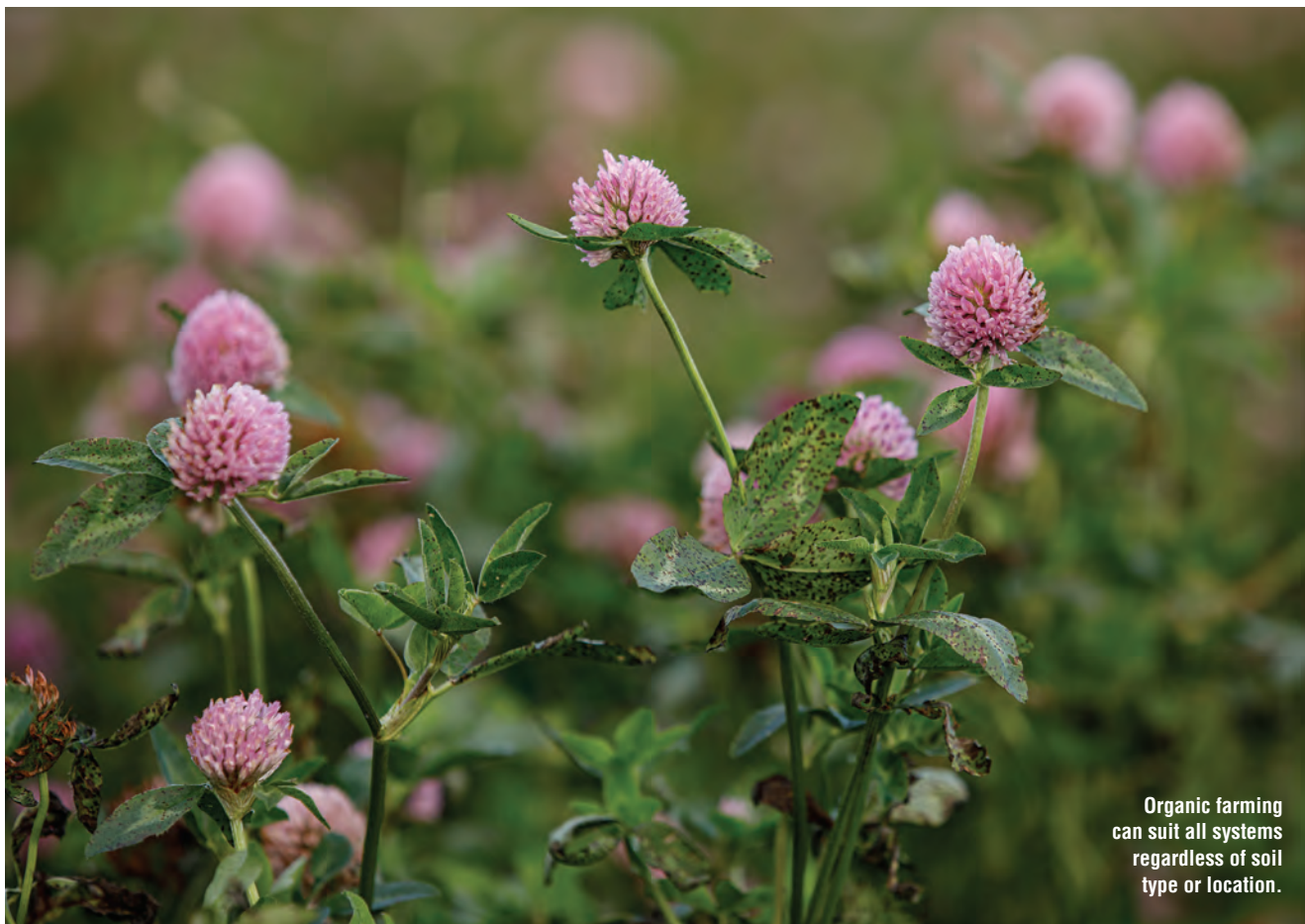
Organic farming can suit all systems regardless of soil type or location.