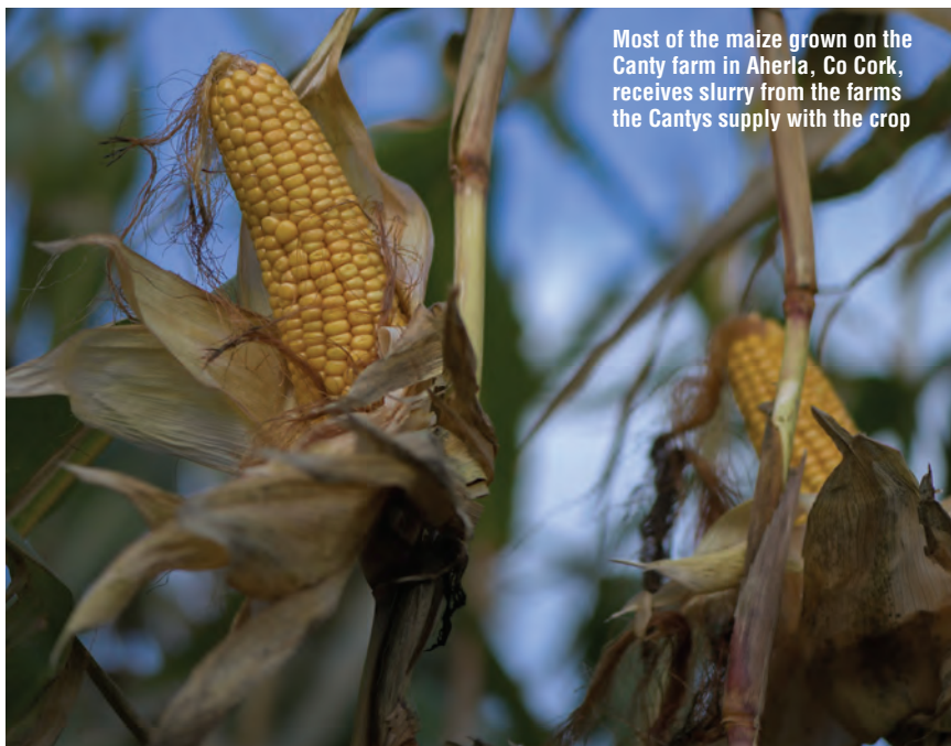
Most of the maize grown on the Canty farm in Aherla, Co Cork, receives slurry from the farms the Cantys supply with the crop

“The tillage man and the dairy man can both benefit,” concludes Niall Canty. “And we’re doing our bit for the environment too.”