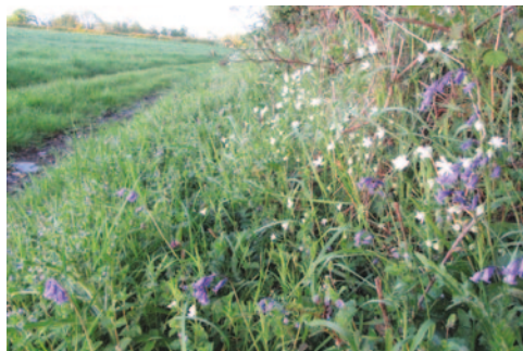
Field margins are networks for nature.

Field margins comprise rough grassland on the edge of fields of intensively managed farmland. Their linear nature provides corridors of movement and networks for nature through the countryside, as well as being habitats of high biodiversity value. Their structural diversity, as well as the diversity of flora,