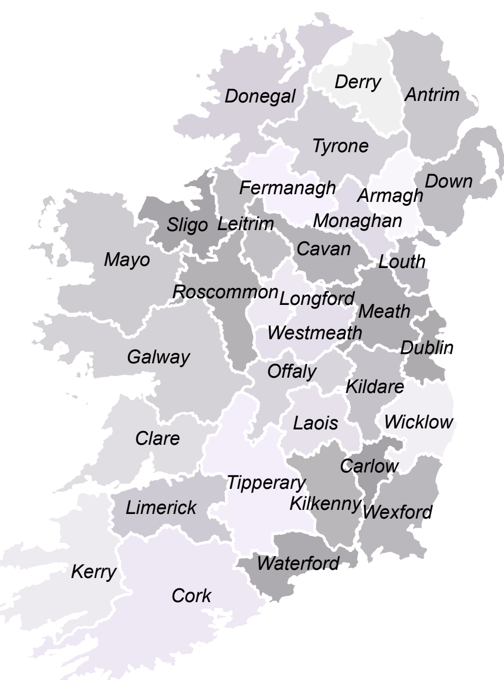
Counties of Ireland